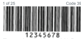
Example 1D (Code 39) Barcode